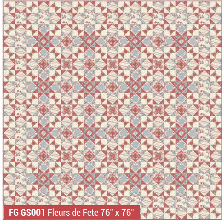
FG GS001 Fleurs de Fete 76" x 76"