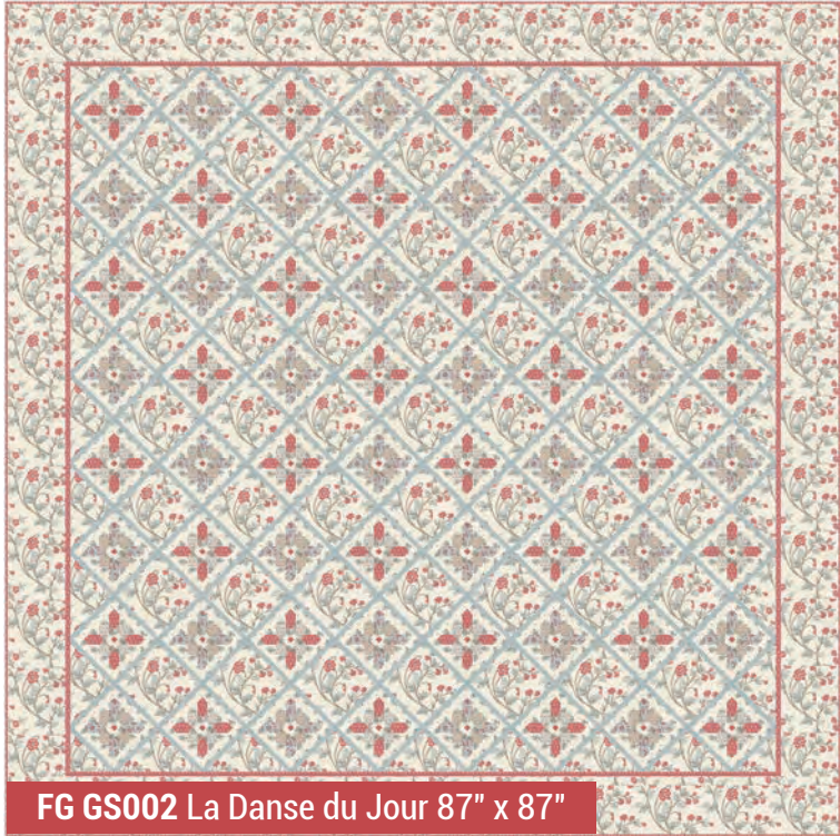
FG GS002 La Danse du Jour 87" x 87"