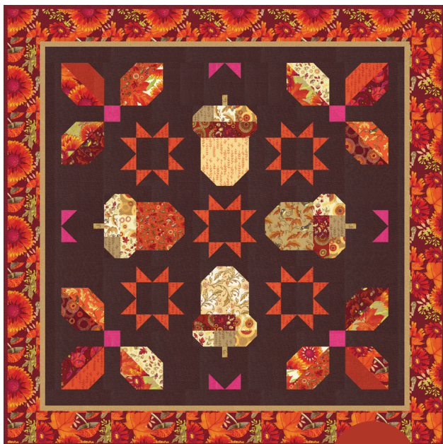
RPQP AQ148 Acorn Quartet 41" x 41" Light colorway also available Pictured on front cover.