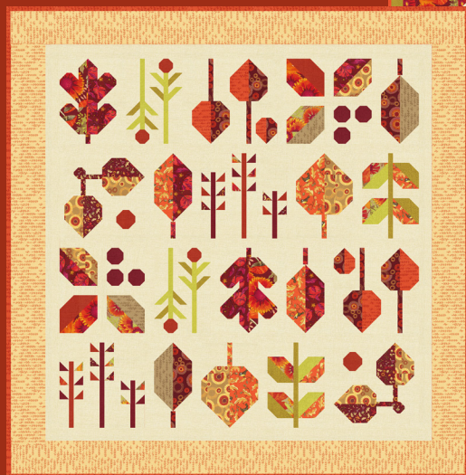
RPQP BS150 Leaf Press 48" x 50"