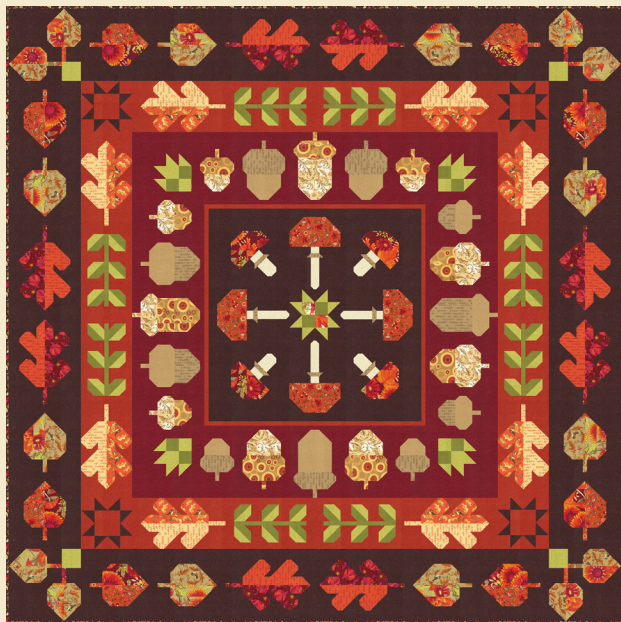
RPQP OGS151 Oak Grove Square Dark Version 72" x 72" Light Version also available

RPQP FT152 Forest Treasures Pillows 18" x 18" & Table Runner 60" x 16" PP Friendly