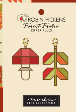
RP100 Mushroom Zipper Pulls Mul 3 Size: approx 1" x 1.5"