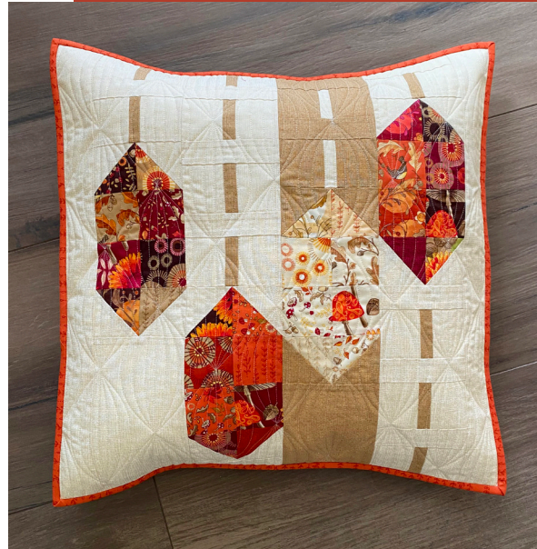
PS48740 Traveling Leaves Mini Wall Quilt or Pillow 20" x 20"