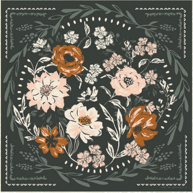
FS 1044 Bandana Set of 2 22" x 22" Mul 6