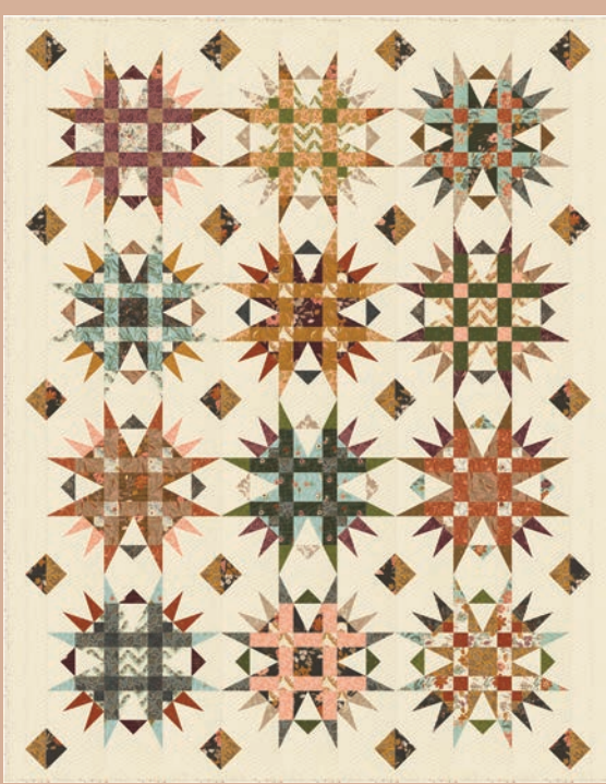
FTD 245 Heirloom Quilt 68" x 74" LC Friendly