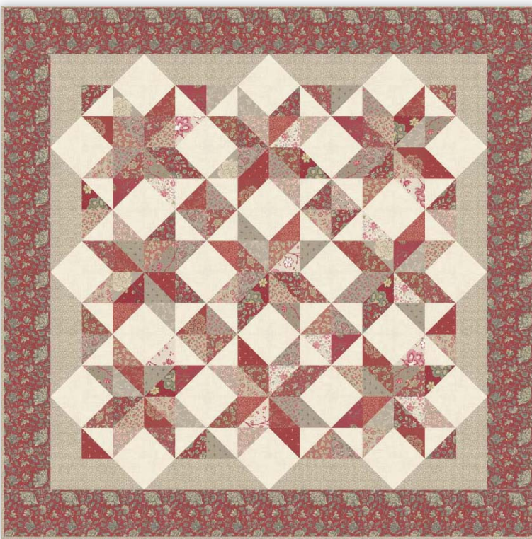
PSD 403P/ PSD 403PG