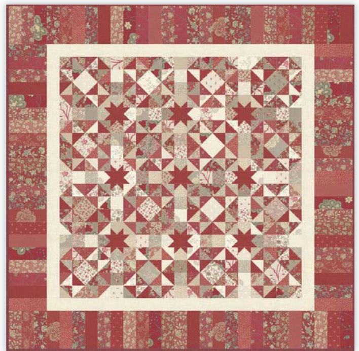
PSD 404P/ PSD 404PG Kaleidoscope of Stars Quilt measures 54" x 54"